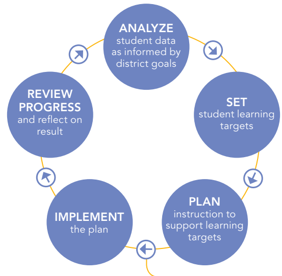
FIGURE 1 Our Research-Based Coaching Model for Teachers

During the 2017–2018 school year, based on the district’s Lexile® study and first-year results with the three programs, ICLE is providing a major professional learning focus on literacy. Reading and Writing Across Content Areas is a three-day workshop broken out by grade level and content area that equips teachers and leaders with tools, strategies, and techniques to infuse reading and writing into content-focused teaching and learning. This professional learning has helped the district comply with ESSA literacy requirements and equipped teachers and leaders with practical approaches to incorporate reading and writing—and higher levels of rigor and relevance—into all curriculum areas.